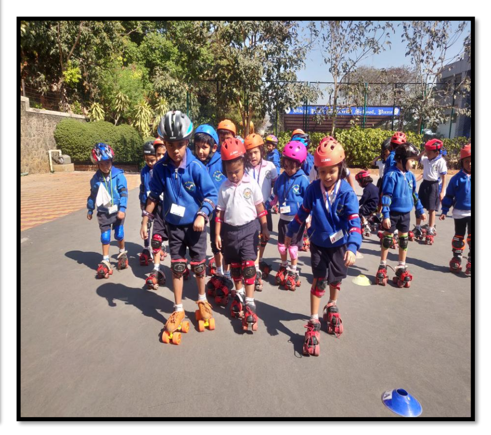
Wiklie Hatil Memorial School, Hune