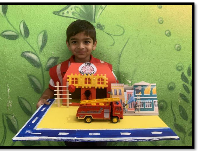
Wiklie Patil Memorial School, Plune