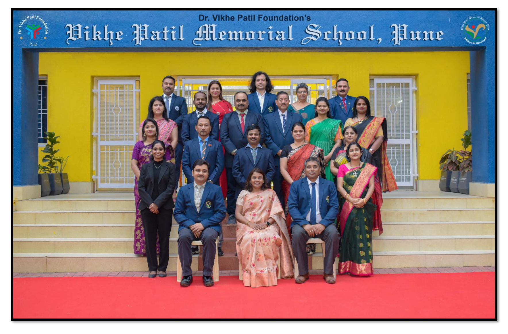
Wiklie Patil Memorial School, Hune