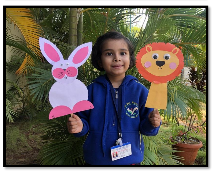
Wiklie Patil Memorial School, Plune