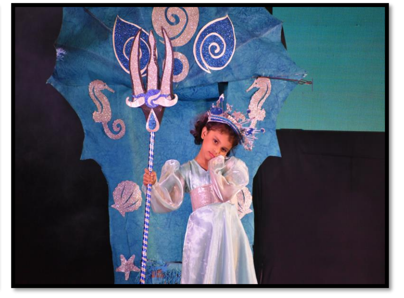
Wiklie Patil Memorial School, Plune