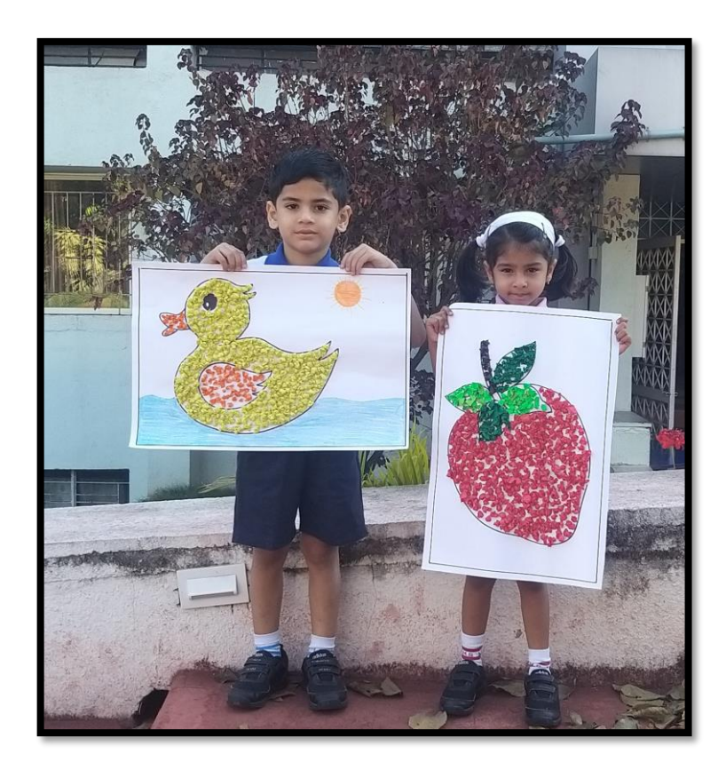
Wiklie Patil Memorial School, Plune