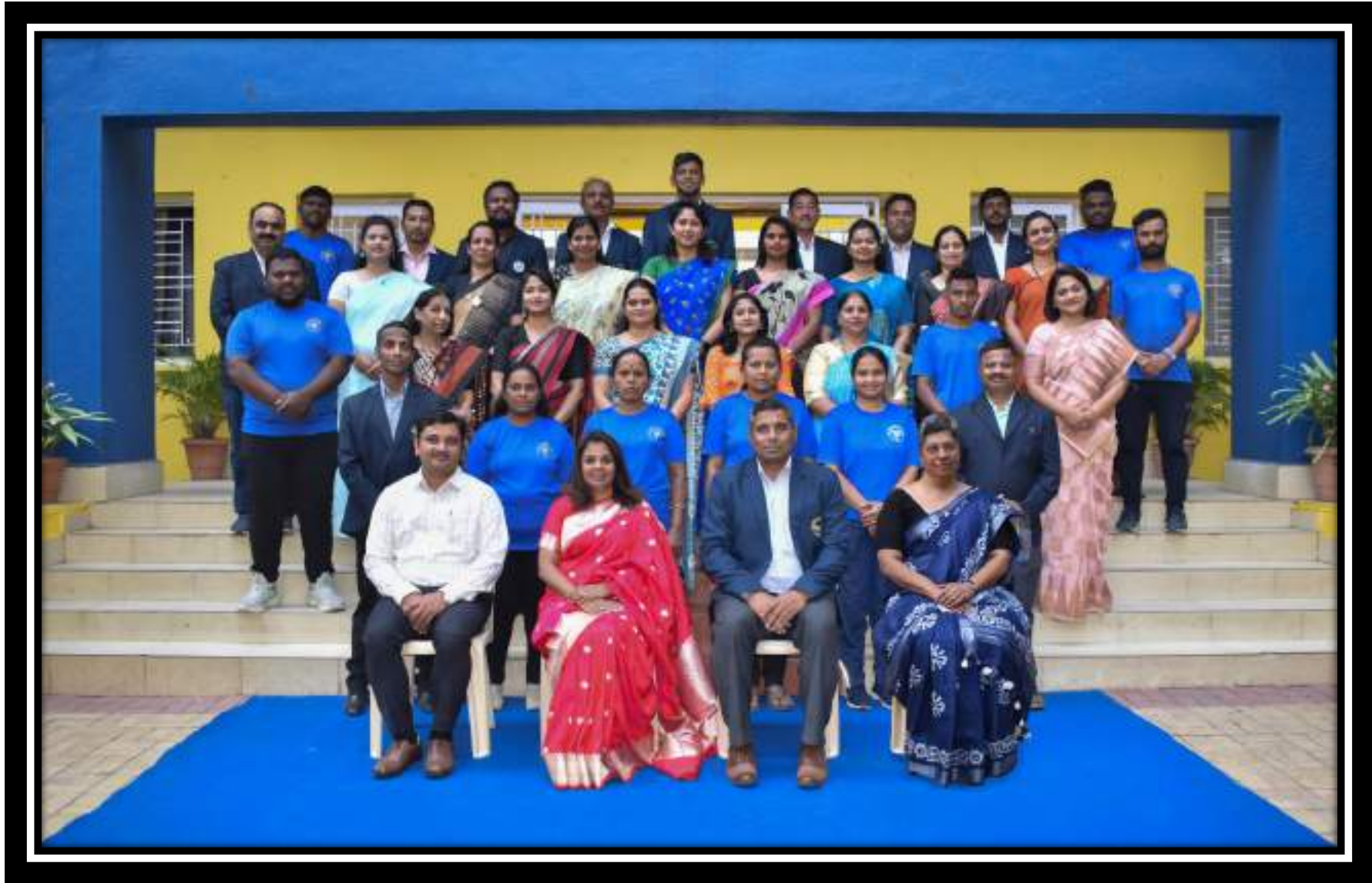
Vikhe Patil Memorial School, Pune