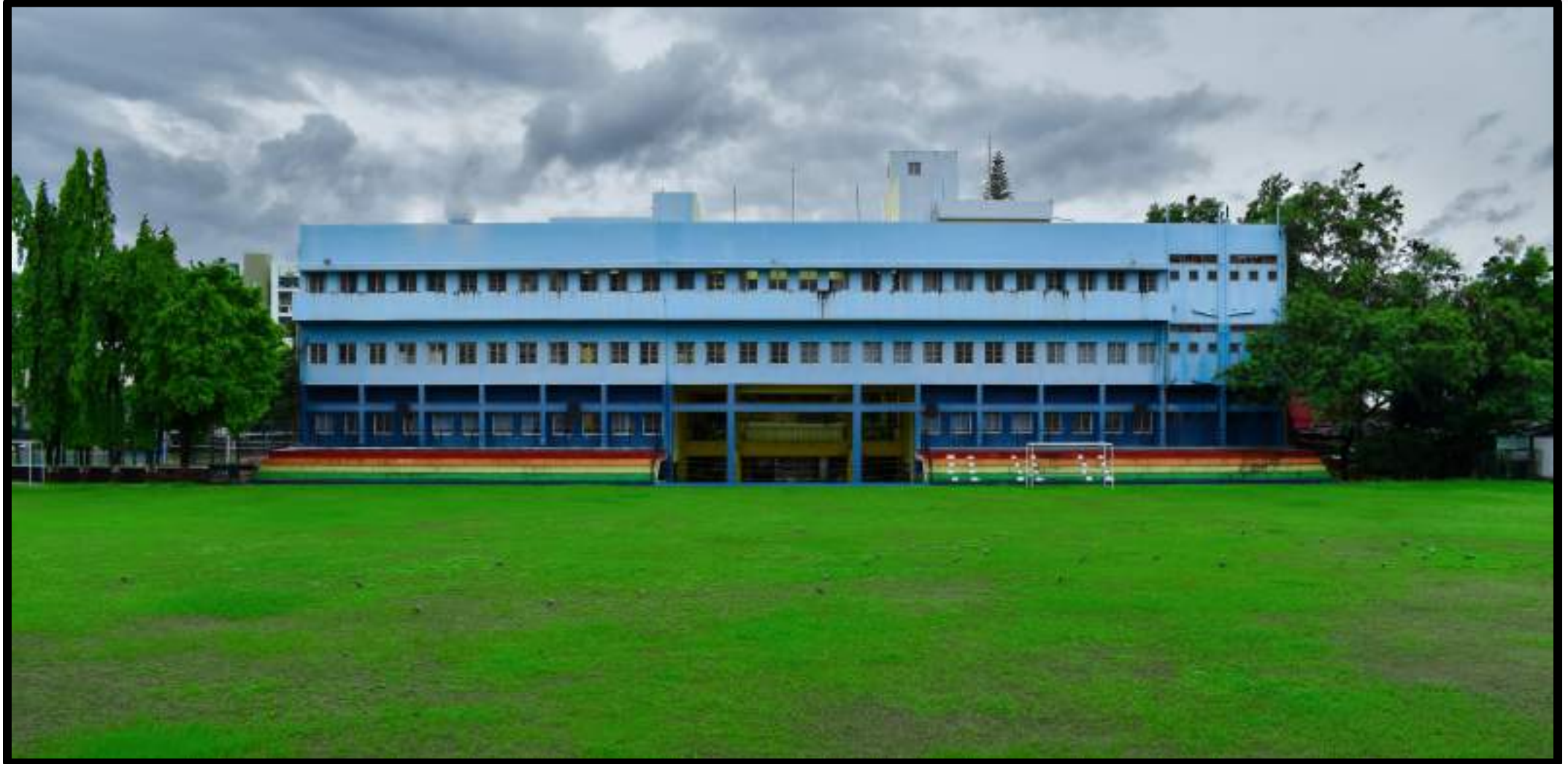
Vikhe Patil Memorial School, Pune